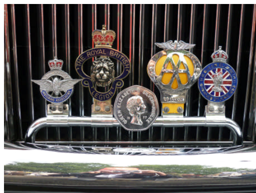
Jubilee badge bar